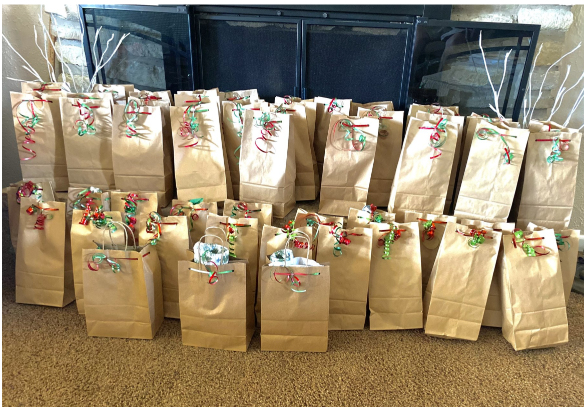
Presbyterian women provided 50 Christmas gifts for Trinity nursing home residents

I'm hoping to also make about 50 toiletry kits. All of these items should be travel size: shampoo and conditioner, soap, lotion, deodorant, nail clippers, nail file, hand sanitizer, Clorox wipes, lip balm, toothbrush and tooth paste, hairbrush and hair ties, wash cloth