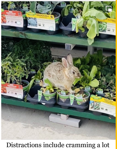
Distractions include cramming a lot into our daily living and making promises to God that fall through due to the haste of our busy lives.

Martha, Martha—poor Martha. How are you like Martha? What are the distractions that keep you from focusing on God? Laundry? Working? Sports? Carting kids around the states to sporting events? Self-focus on health problems? It is likely that we are so busy—whether we are children, college-aged, middle-aged, seniors, or retired—that we do not take time to make room for God in the houses