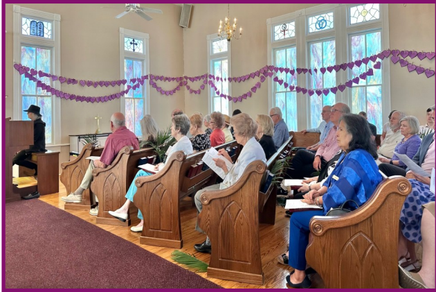
Acts Of Kindness